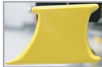
Extruded Finish Blade Profile